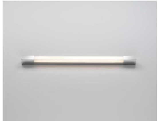
CODE: 1150016 FINISH: POLISHED CHROME

TO MAINTAIN THIS PRODUCT TO ITS BEST CONDITION, PLEASE VIEW OUR CARE AND CLEANING GUIDE ON THE SUPPORT SECTION OF THE ASTRO WEBSITE.