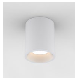
CODE: 1326019 FINISH: TEXTURED WHITE

TO MAINTAIN THIS PRODUCT TO ITS BEST CONDITION, PLEASE VIEW OUR CARE AND CLEANING GUIDE ON THE SUPPORT SECTION OF THE ASTRO WEBSITE.