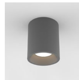
CODE: 1326018 FINISH: TEXTURED GREY