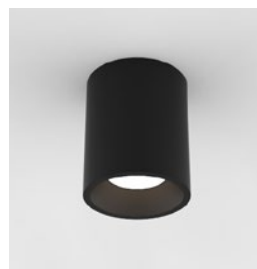
CODE: 1326017 FINISH: TEXTURED BLACK