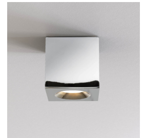
CODE: 1326046 FINISH: POLISHED CHROME

THIS PRODUCT IS NOT SUITABLE FOR INSTALLATION WITHIN FIVE MILES OF THE COAST. FOR THESE ENVIRONMENTS, PLEASE FILTER PRODUCTS ON THE ASTRO WEBSITE BY 'COASTAL'.