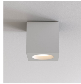
CODE: 1326043 FINISH: MATT WHITE