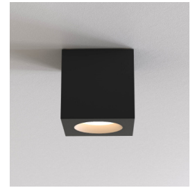
CODE: 1326044 FINISH: TEXTURED BLACK