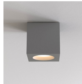
CODE: 1326045 FINISH: TEXTURED GREY